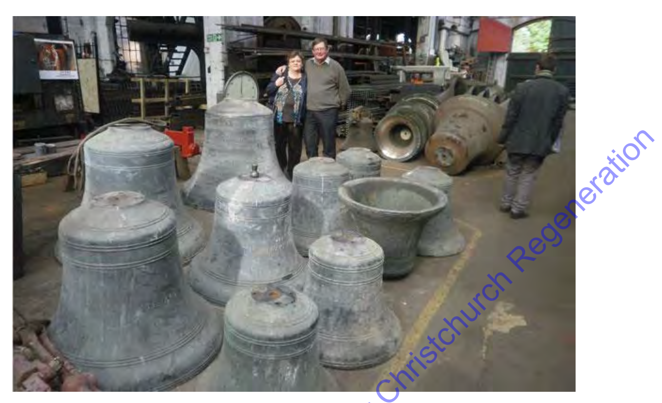
This photograph shows the bells of Christ Church Cathedral being repaired in England. The bells are an outstanding example of generous benefaction.

There are imaginative ways such as these to acknowledge donors and inspire visitors as this illustration shows.