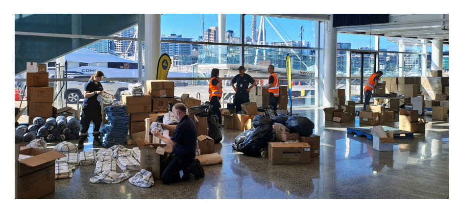
Image: Selwyn volunteers sorting supplies that had been returned from Auckland Civil Defence Centres so that it could be stored and reused.

A key feature of the science response to this disaster was the Hikina Whakatutuki Ministry of Business, Innovation and Employment (MBIE) 'North Island Extreme Weather Event' platform, which provided ~$10 million to enable urgent and high-priority science to support the emergency response and recovery. All the CSAs were asked to provide